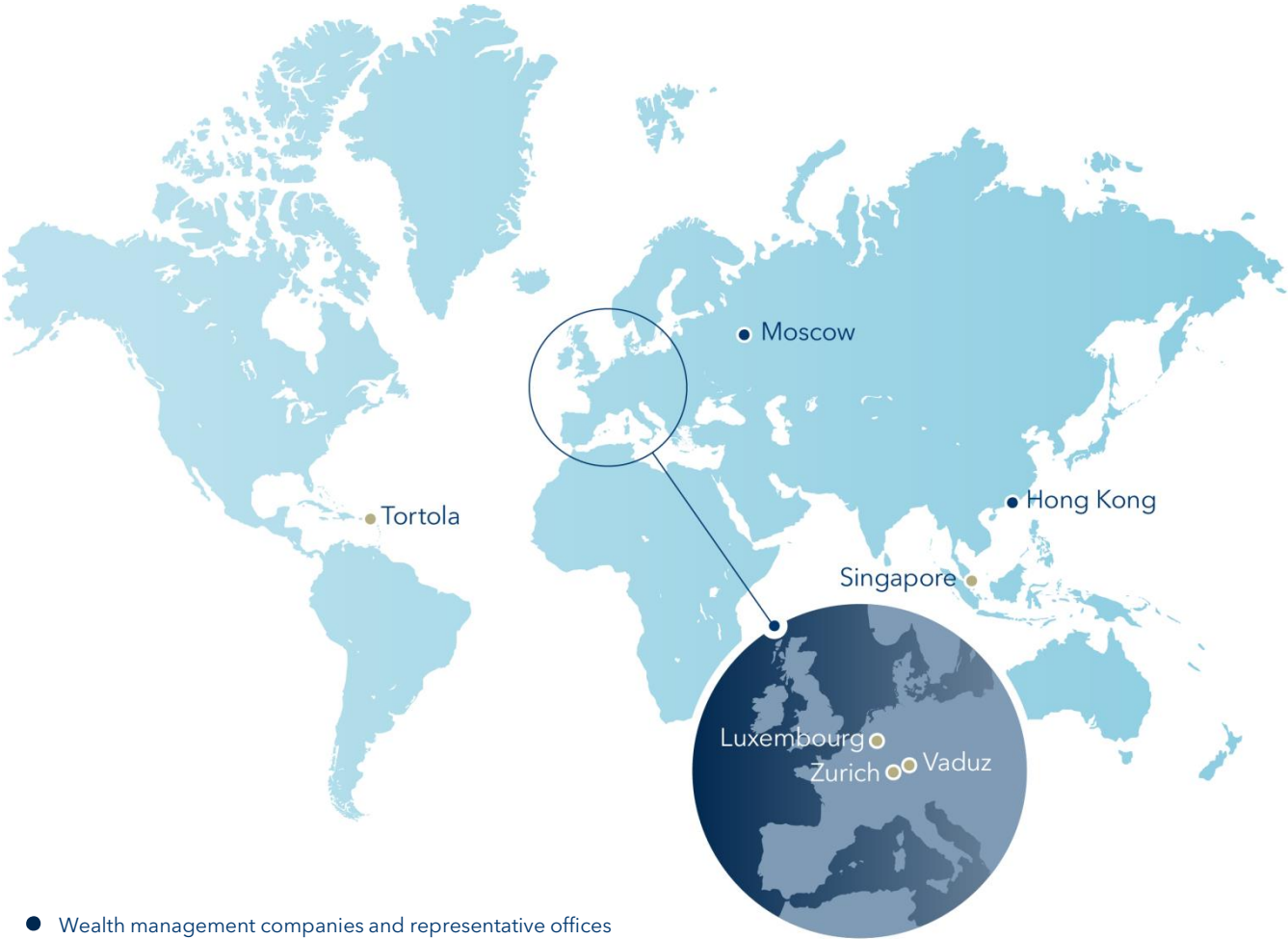
The VP Bank Group locations